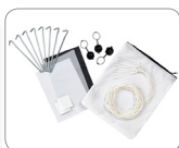
Stake/Guide Ropes & Repair Kit