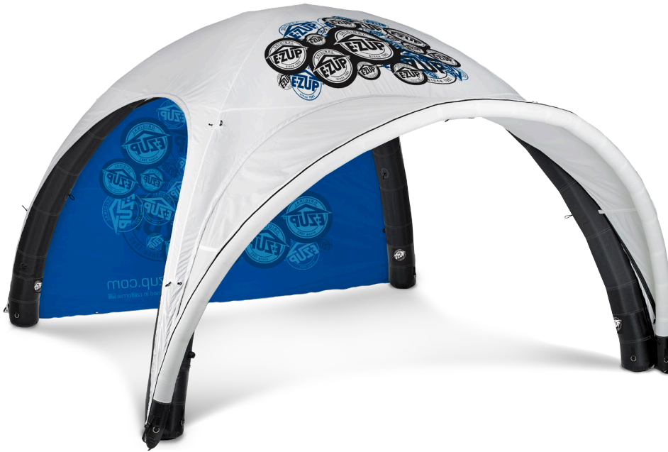
Aero Dome™ with Custom Top, Sidewall & Awning