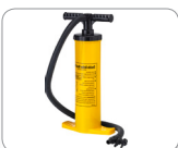
Manual Air Pump