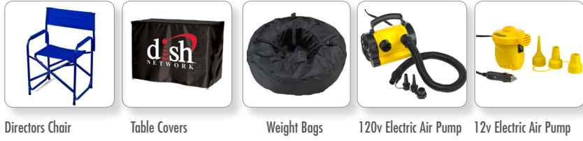
Directors Chair Table Covers Weight Bags 120v Electric Air Pump 12v Electric Air Pump